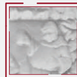
Accuracy up to 0.05 mm