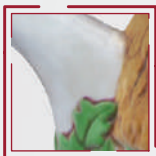
Colour texture capturing