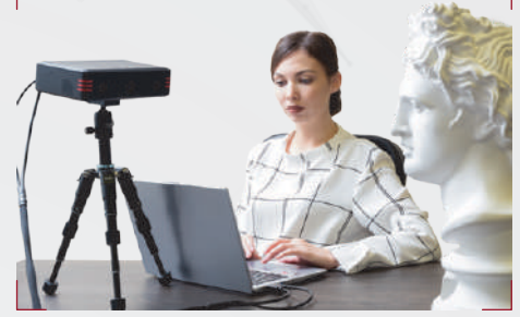
Scanning by geometry